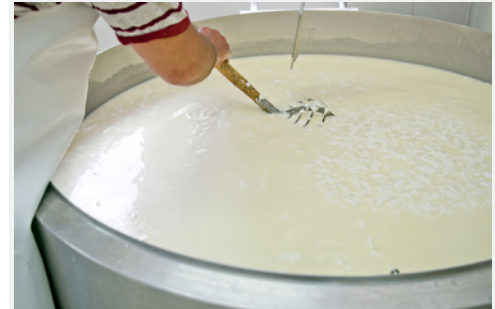
High moisture and fat content materials like whey often cause bridging problems.

A cheese company found themselves in a very sticky situation. The whey protein concentrate (WPC), which has a very high moisture and fat content, was prone to bridging over the discharge. Unfortunately, this wasn't just delaying production. The caked material had sparked a fire in one of their baghouses. Bridging had become an urgent safety concern.