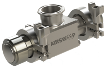
AirSweep® USDA 135